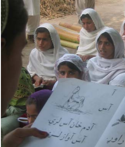
Of the six million children enrolled in primary and secondary school, 35 percent are girls.